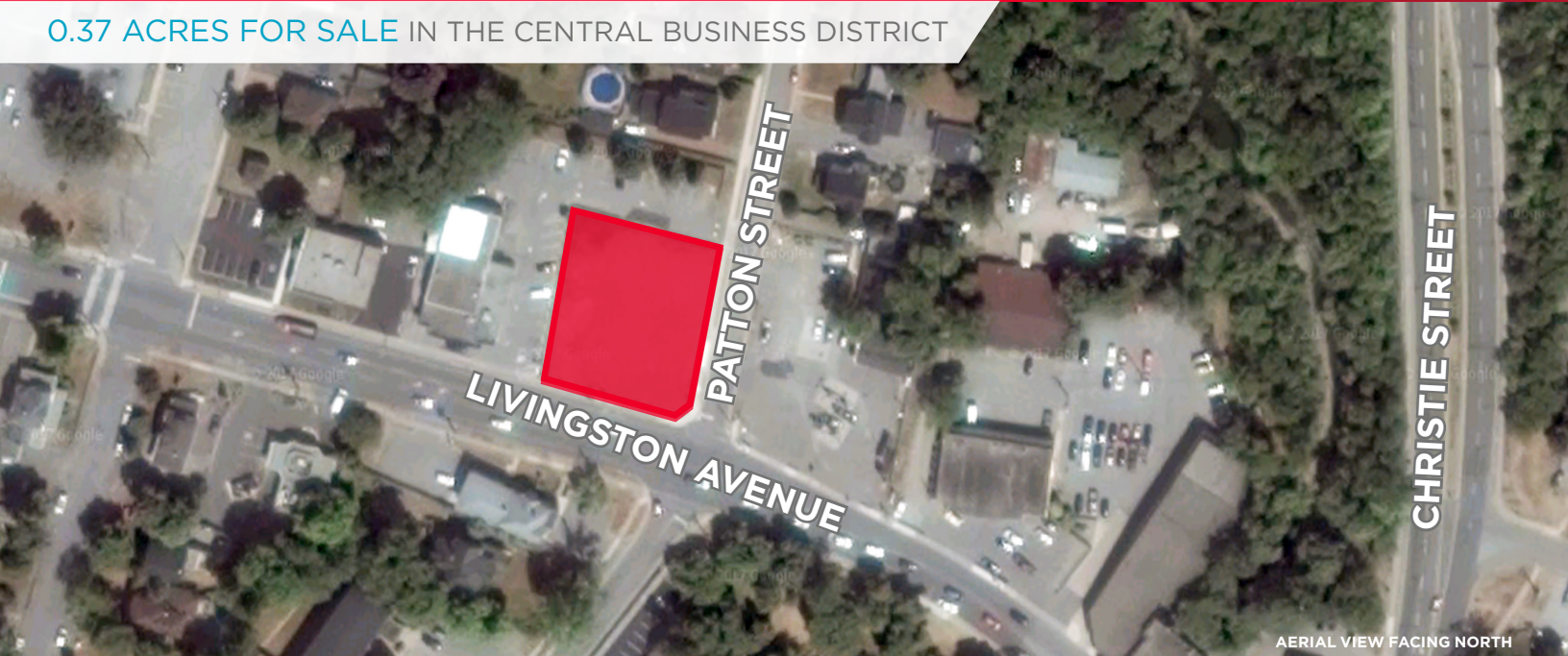
AERIAL VIEW FACING NORTH

0.37 ACRES FOR SALE IN THE CENTRAL BUSINESS DISTRICT